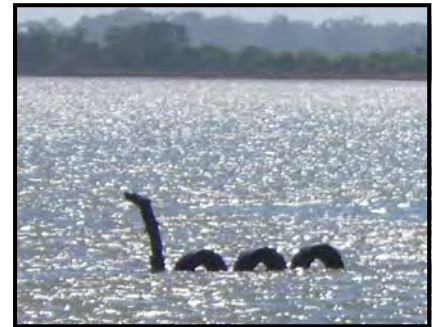
Our very own unusual sea creature