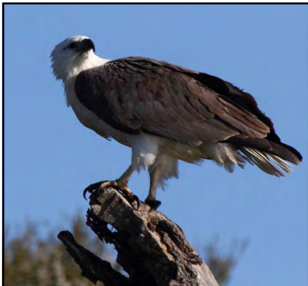
Picture 1/ A huge catch; Picture 2/ Pelican, eagle encounter; Picture 3/ Emus in National Park; Picture 4/ Swan on her nest; Picture 5/ Male on guard