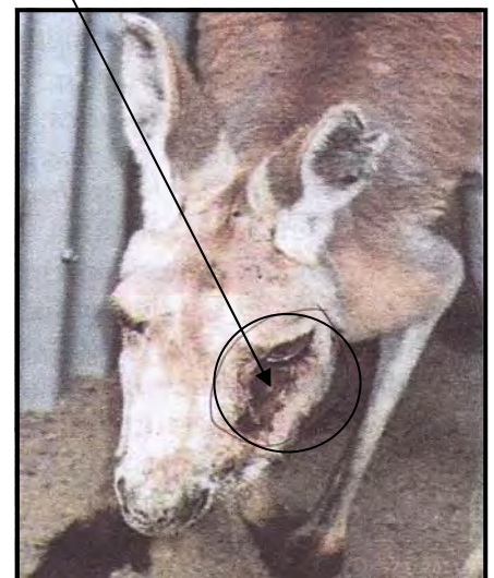
Abscess from over feeding with bread

Thanking you all, until next time Donna Loch Sport Wildlife Shelter