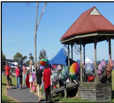
Stalls at the Bush Market