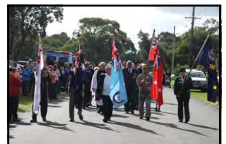
Marching in Lake Street