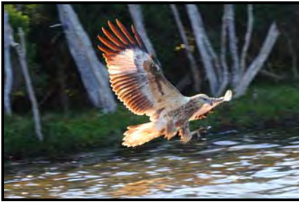
4 year old fishing