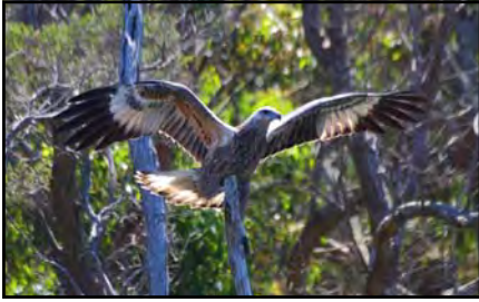
2 year old juvenile